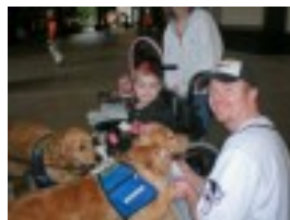
POW Ambassadors at Orioles Game