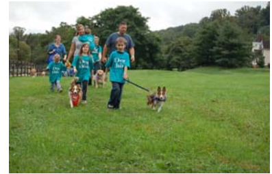
Photo: Dog-A-Thon 2009