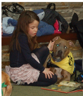
Rocco listening patiently

Once again, we have ten volunteer teams who are “reading buddies” for elementary school children who are having difficulty reading. The students each get a dog that will attend every week for six weeks to read to. This program has been extremely successful as the children find the dogs non judgmental and it easier to read to them than to people. Thanks to the ten volunteers who make this program so successful.